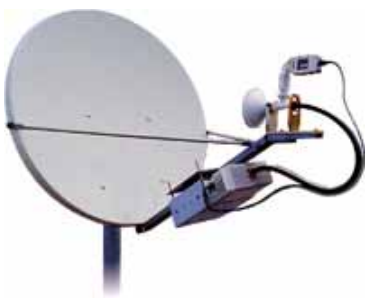
Ku-Band VSAT Terminal Outdoor Dish & RF

For higher availability applications, or higher guaranteed throughputs a 1.8m antenna may be required.